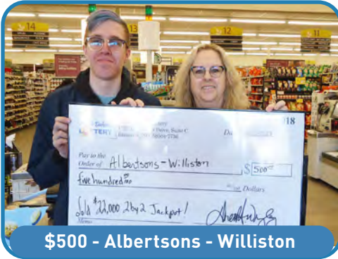
$500 - Albertsons - Williston