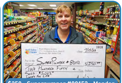
$250 - Superpumper #80152 - Mandan