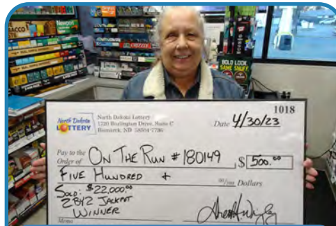
$500 - On the Run #80149 - Bismarck