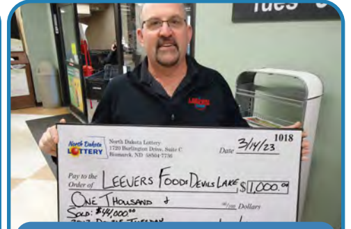
$1,000 - Leever's Foods - Devils Lake