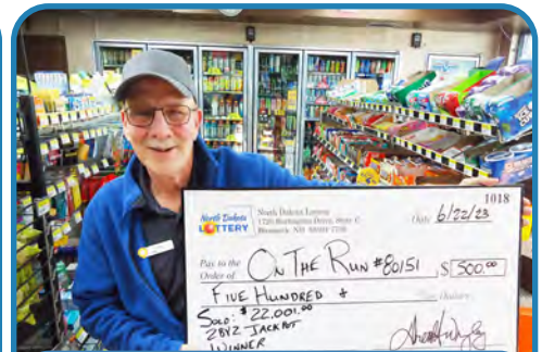
$500 - On the Run #80151 - Mandan