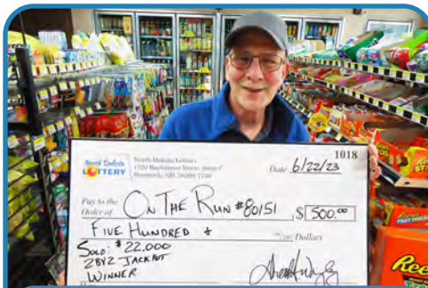
$500 - On the Run #80151 - Mandan