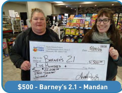
$500 - Barney's 2.1 - Mandan