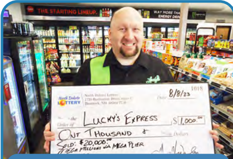
$1,000 - Lucky's Express - Dickinson