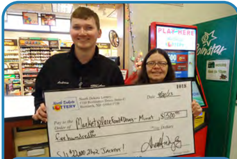
$500 - Marketplace Food & Drug - Minot