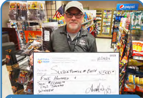
$500 - Superpumper #80154 - Rugby