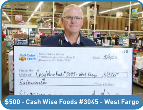
$500 - Cash Wise Foods #3045 - West Fargo