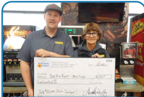
$500 - On the Run #80143 - New Town