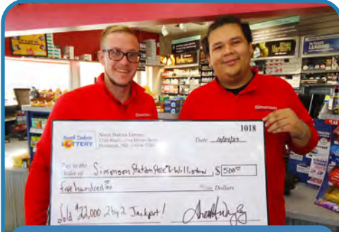
$500 - Simonson Station Store #6 - Williston