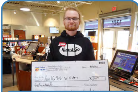
$500 - Kum & Go #806 - Williston