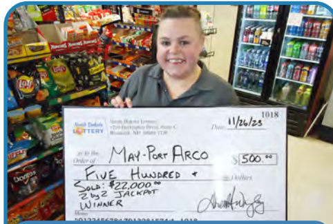
$500 - May-Port Arco - Mayville