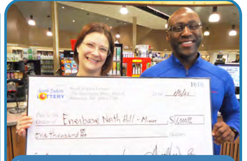
$1,000 - Enerbase North Hill - Minot