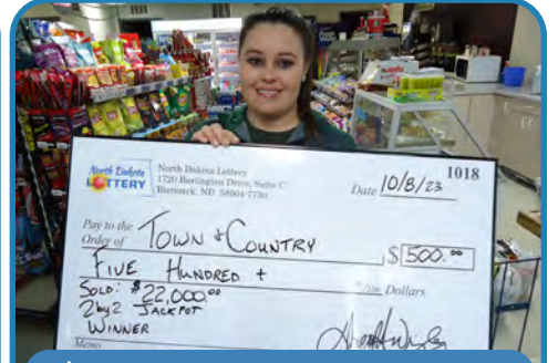
$500 - Town & Country - Rolette