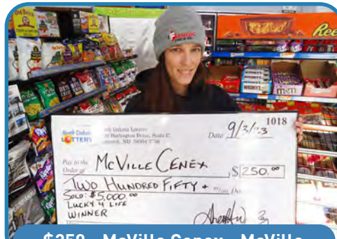
$250 - McVilve Cenex - McVilve