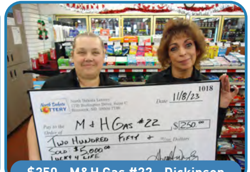
$250 - M & H Gas #22 - Dickinson