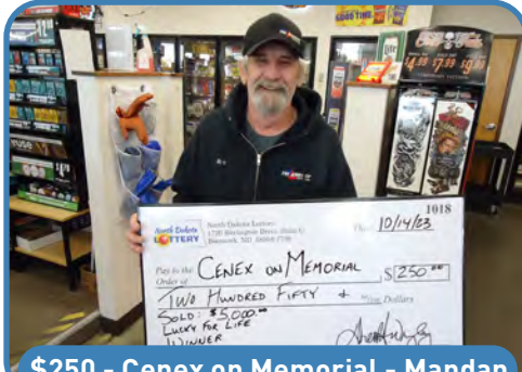
$250 - Cenex on Memorial - Mandan