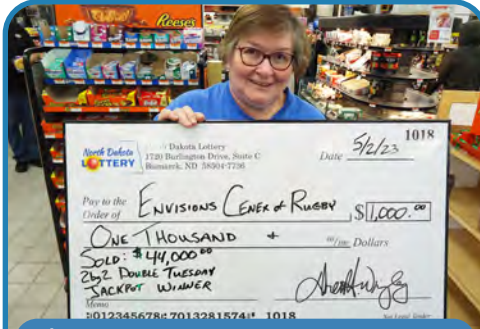
$1,000 - Envisions Cenex - Rugby