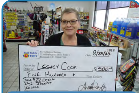
$500 - Legacy Cooperative - Cando