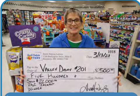
$500 - Valley Dairy #201 - Grand Forks