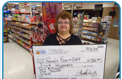
$500 - Rosie's Food & Gas - Dickinson