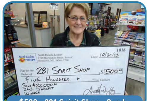
$500 - 281 Spirit Shop - Cando