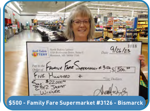
$500 - Family Fare Supermarket #3126 - Bismarck