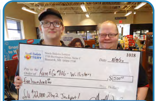
$500 - Kum & Go #806 - Williston