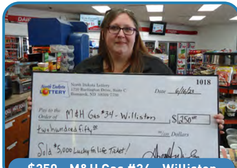
$250 - M & H Gas #34 - Williston