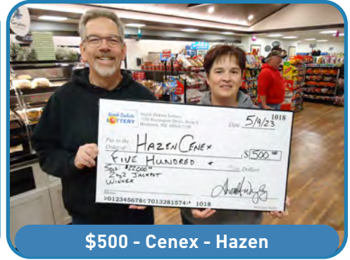
$500 - Cenex - Hazen