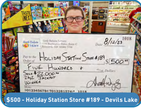
$500 - Holiday Station Store #189 - Devils Lake