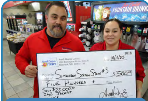
$500 - Simonson Station Store #3 - Grafton