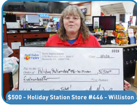
$500 - Holiday Station Store #446 - Williston