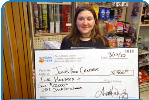
$500 - John's Food Center - Lincoln