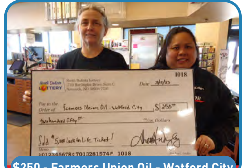
$250 - Farmers Union Oil - Watford City