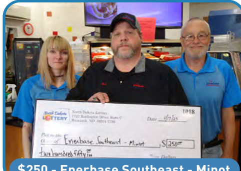
$250 - Enerbase Southeast - Minot