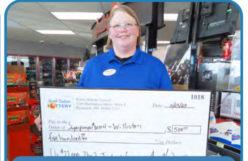
$500 - Superpumper #80104 - Williston