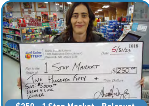
$250 - 1 Stop Market - Belcourt