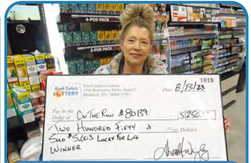
$500 - On the Run #80139 - Bismarck