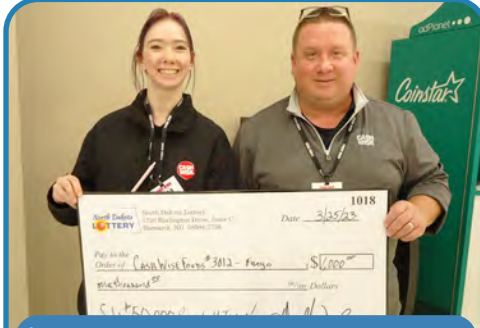
$1,000 - Cash Wise Foods #3012 - Fargo