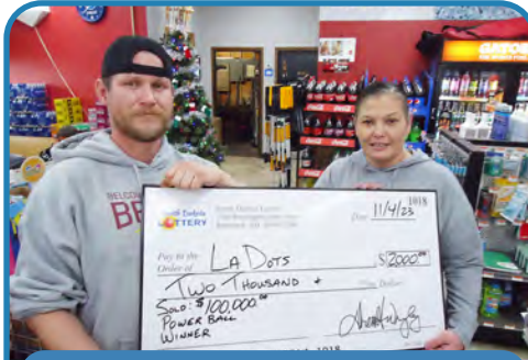
$2,000 - La'Dots - Belcourt