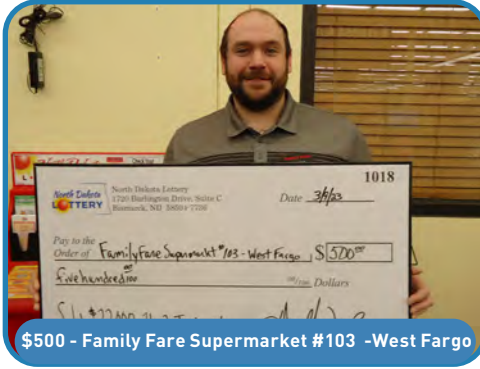
$500 - Family Fare Supermarket #103 -West Fargo