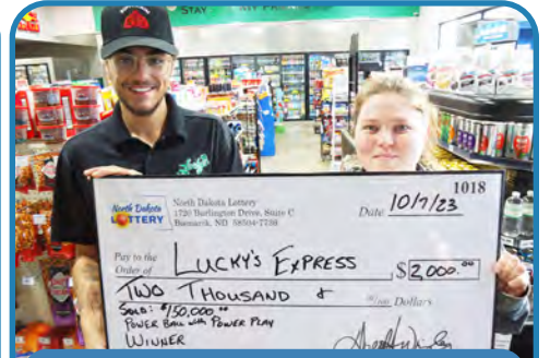
$2,000 - Lucky's Express - Dickinson