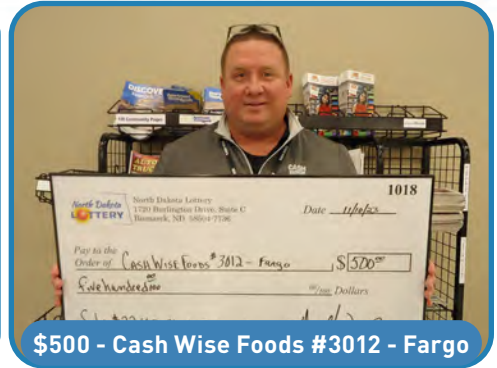
$500 - Cash Wise Foods #3012 - Fargo