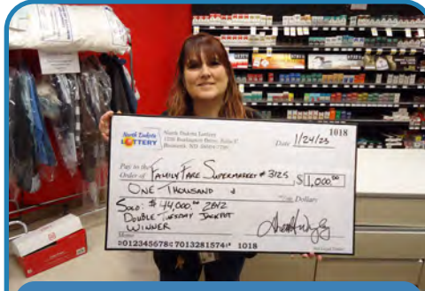
$1,000 - Family Fare Supermarket #3125 - Bismarck