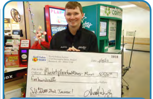
$500 - Marketplace Food & Drug - Minot