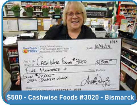
$500 - Cashwise Foods #3020 - Bismarck