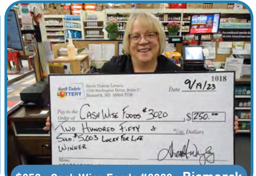
$250 - Cash Wise Foods #3020 - Bismarck