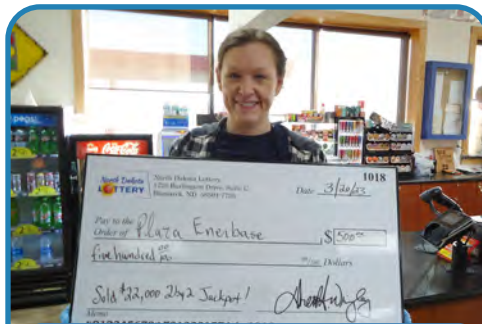
$500 - Plaza Enerbase - Plaza