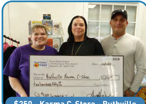
$250 - Karma C-Store - Ruthville