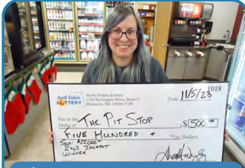
$500 - The Pit Stop - Dickinson