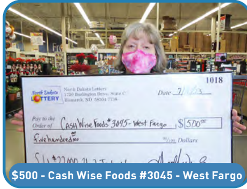
$500 - Cash Wise Foods #3045 - West Fargo