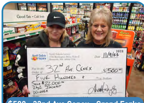
$500 - 32nd Ave Cenex - Grand Forks