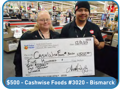
$500 - Cashwise Foods #3020 - Bismarck