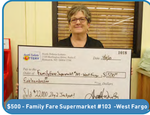
$500 - Family Fare Supermarket #103 -West Fargo