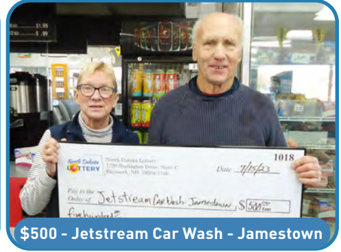
$500 - Jetstream Car Wash - Jamestown