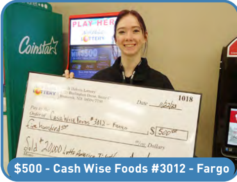
$500 - Cash Wise Foods #3012 - Fargo