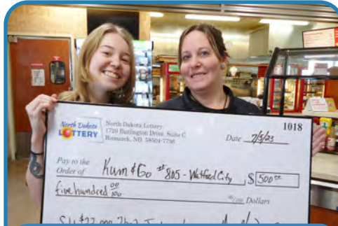
$500 - Kum & Go #804 - Watford City